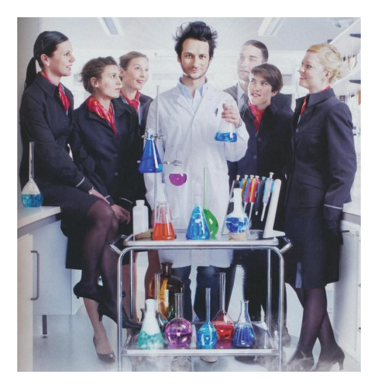
Figure 2. Picture from a university science program advertisement

The second integrated lecture gave a theoretical overview of natural science history and culture, which included critiques by feminist science philosophers. At the seminars following this lecture the students were given several individual and group tasks, all aimed at "spotting" the culture of natural sciences and interpreting stories conveyed in parallel to the subject content. In one such reflection task, a picture from a university science program advertisement was used (Fig. 2). The students also performed analyses of texts and pictures in school science textbooks, starting with questions like these: What epistemological view is mediated? What is the relationship of humans and nature? Is nature portrayed from an androcentric perspective or does it show an intrinsic value of the subject? Is the text formal, factual, and does it put facts into context? Is the text relational or distanced? How do the texts and images connect to each other? Are there gender issues? Who/what is included or excluded?