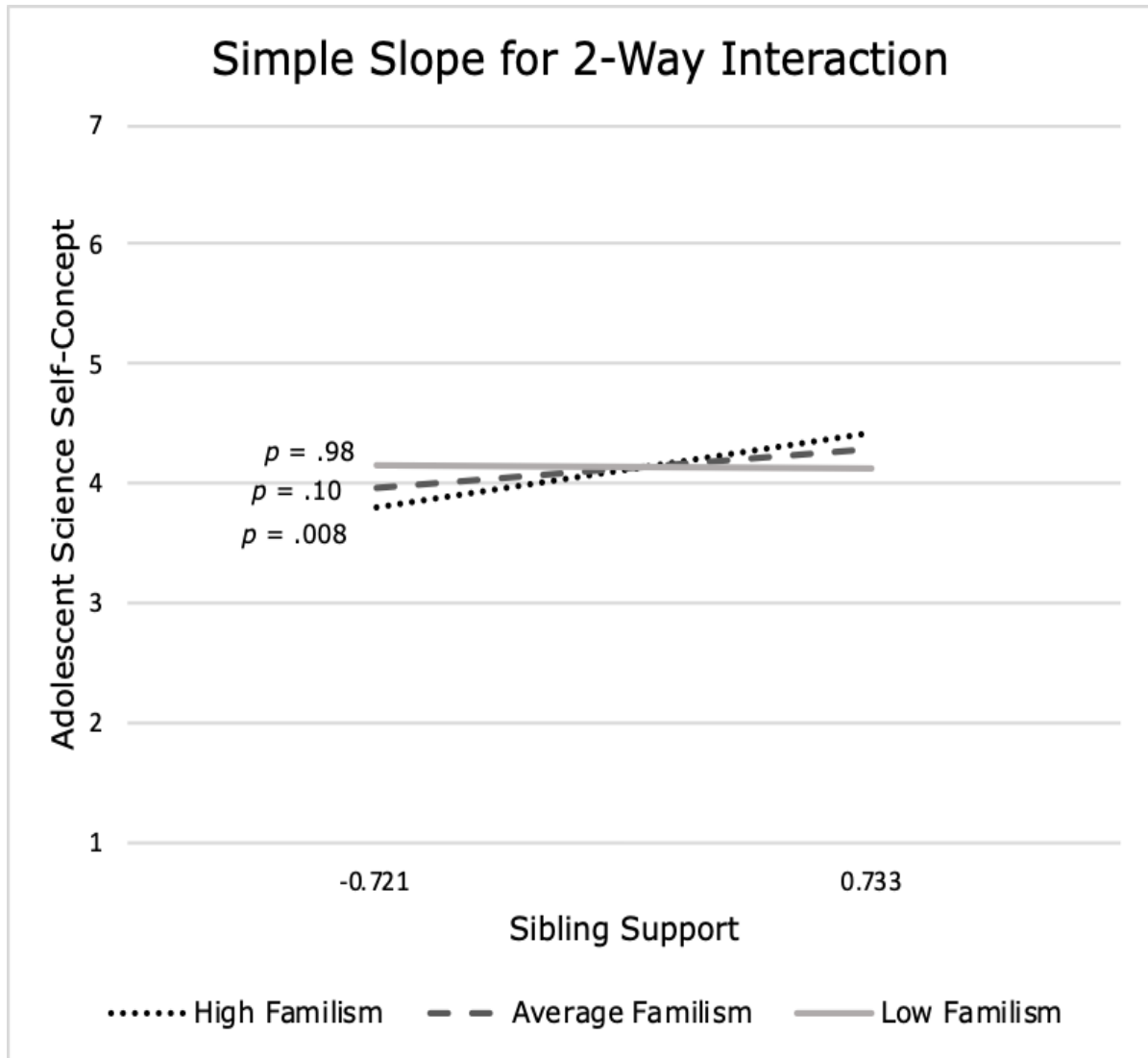
Figure 1. Simple slope analysis for the 2-way interaction between sibling support and sibling familism values on adolescent science self-concept.

The last research aim was to understand the extent to which older sibling gender and familism values moderated the association between sibling support and adolescent science motivational beliefs (see Table 3). Testing older sibling gender and familism values as moderators allowed us to examine for whom older sibling support predicts adolescent science motivational beliefs. Contrary to our research hypotheses, older sibling gender did not moderate or alter the relations between sibling support and motivational beliefs (self-concept: \beta = -.01, SE = .20, p = .95 ; task-value: \beta = -.02, SE = .20, p = .93 ). In other words, the relation between older sibling support and adolescent motivational beliefs was similar for adolescents with older sisters and older brothers.